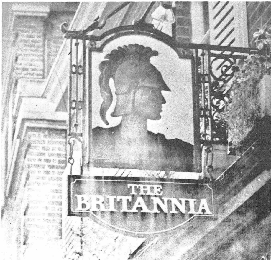
'The Britannia' Allen Street, W8 as featured in last months edition

Produced by the London branches of the Campaign for Real Ale Ltd