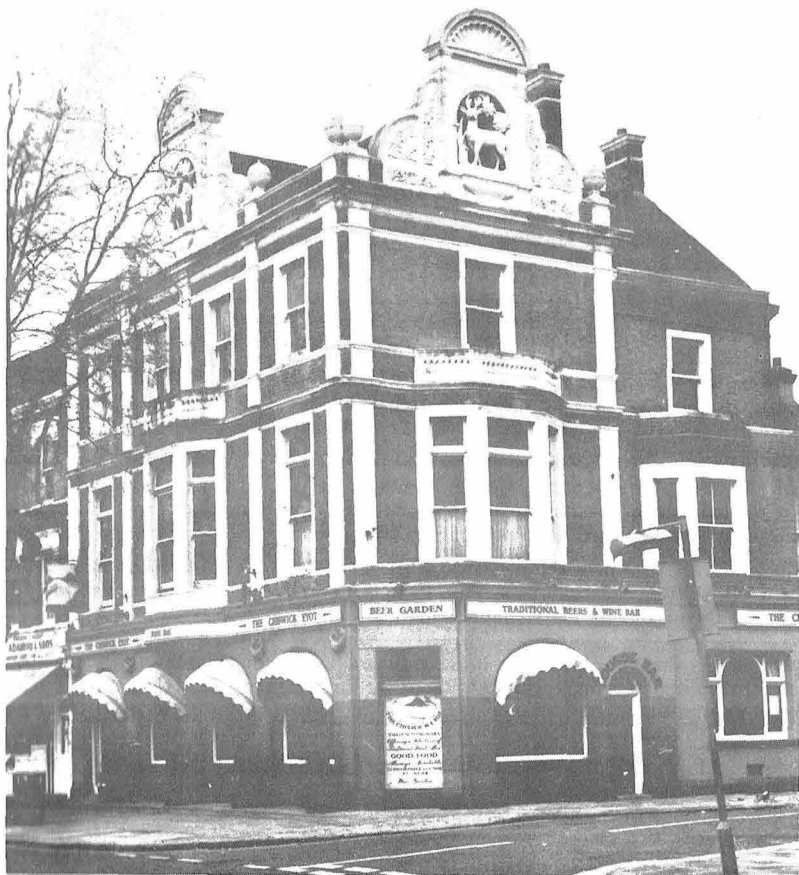
THE CHISWICK EYOT - see page 3.

Produced by the London branches of the Campaign for Real Ale Ltd