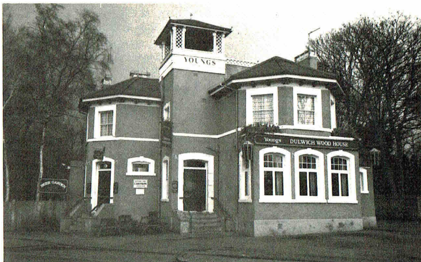
The Dulwich Wood House S.E.26.

Produced by the London branches of the Campaign for Real Ale Ltd