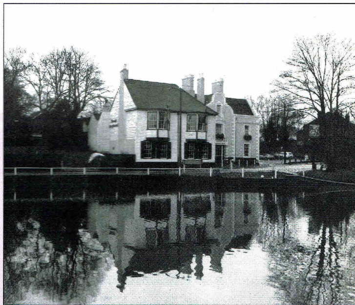
THE GREYHOUND HOTEL 2 High Street, Carshalton

Produced by the London branches of the Campaign for Real Ale Ltd