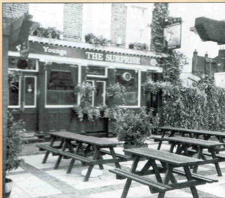
THE SURPRISE, SW8 (1995)

Produced by the London branches of the Campaign for Real Ale Ltd